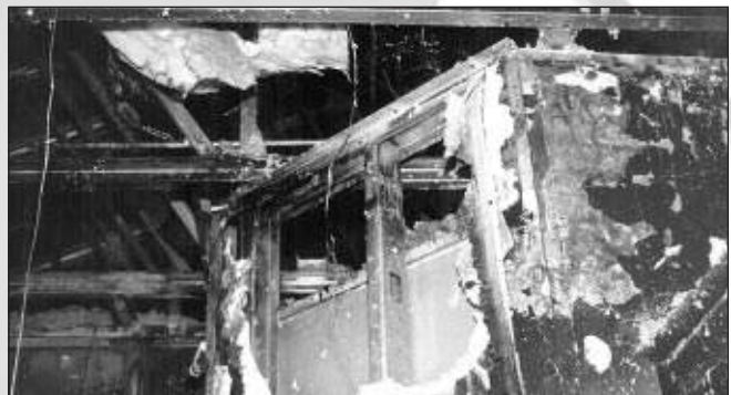
Charred steel studs from 1996 Brentwood, CA home fire maintained structural integrity.

For comparison purposes, most specifications call for greater than 33ksi yield strength for structural studs. "The fire," Simko continued, "seems to have had little effect on the mechanical properties of these members." Further testing produced evidence which indicated the "retention of mechanical strength in spite of the fire and furthermore suggests that the zinc coating remained on the surface," said Simko. "In some places, the zinc coating alloyed with the substrate to create a lightly iron-rich 'galvannealed' coating."